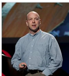
Tulley in 2009

NB: Beverages will be available for purchase from On the Go Espresso from 3.30pm onwards